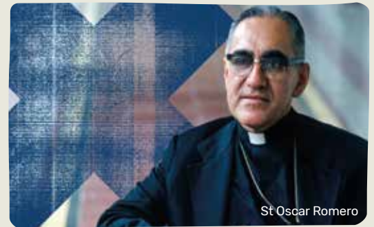
St Oscar Romero