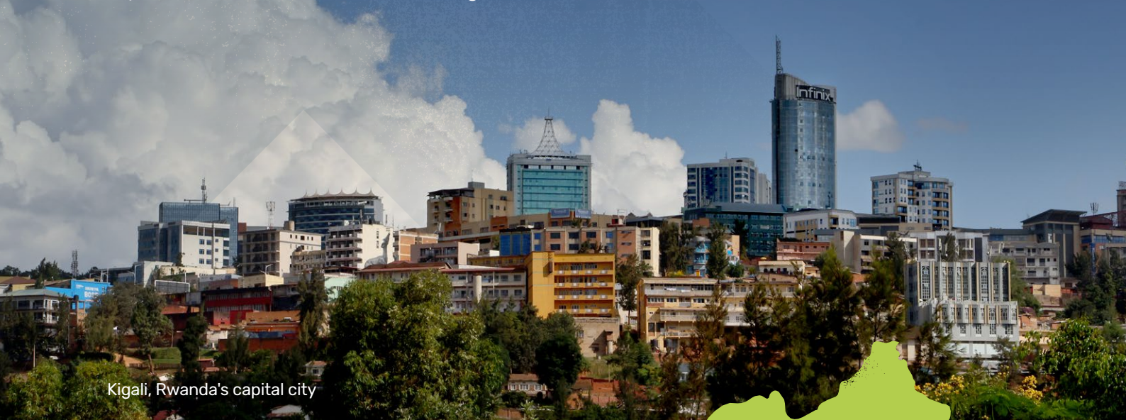
Kigali, Rwanda's capital city

Rwanda's capital Kigali is a modern metropolitan city, bursting with culture. It has a vibrant food, music, dance and art scene and is also home to a myriad of talented individuals including chefs, writers, and artists.