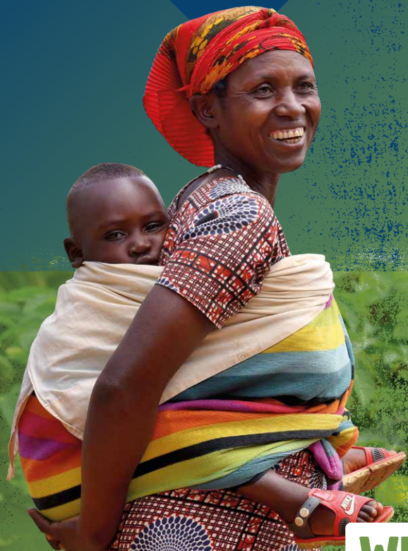
Village scenes, Rwanda

As we journey through Lent, may we be inspired by this call to do good and to share what we have, understanding that our truest offerings are those made in love, kindness, and selflessness, pleasing not just to God but also to our own souls.